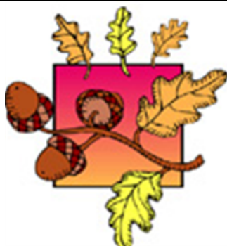
Naturalist Intelligence or Nature Smart

In the workplace, people who require spatial intelligence include: graphic design artists, photographers, architects, airline pilots, and surgeons.